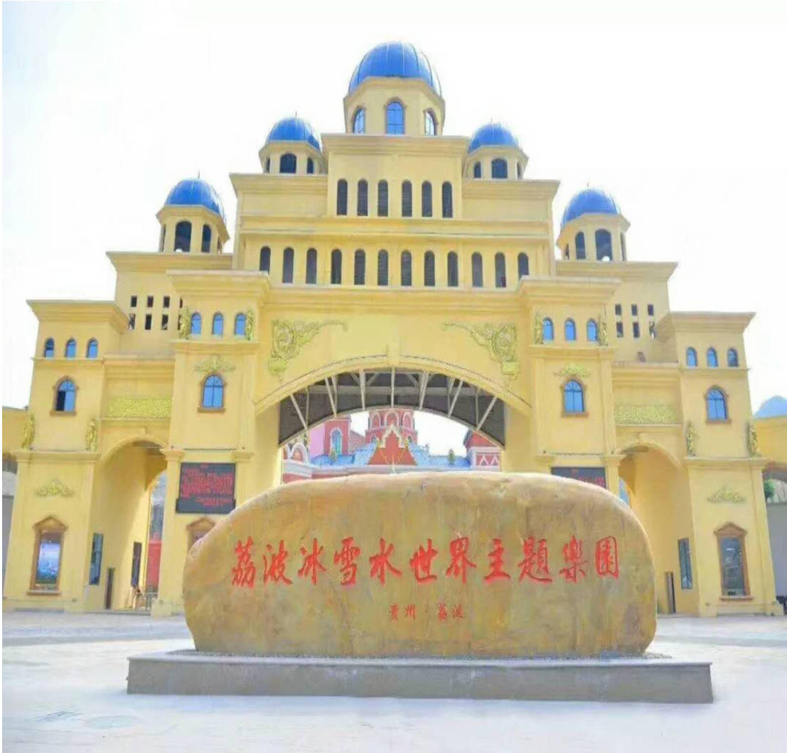
Guizhou Libo Ice and Snow World Project